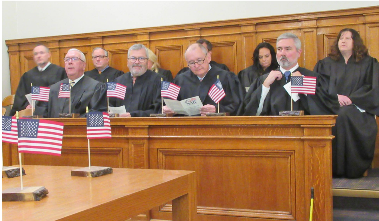
Madison County Judges Attending the Flag Awards Program

Those who expect to reap the blessings of freedom, must, like men, undergo the fatigue of supporting it.