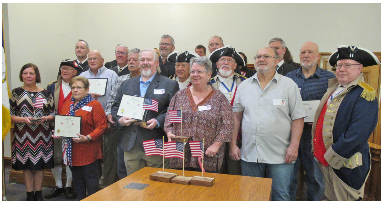
The Award Recipients, Madison County Judges, and GGRC Compatriots